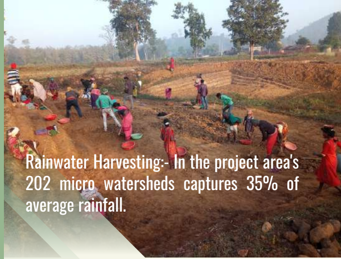
Rainwater Harvesting:- In the project area's 202 micro watersheds captures 35% of average rainfall.

In Rabi, gram, pea, tomato, bitter gourd, and mustard are being cultivated in 1129.77 hectares by 24 Producer Groups, with production just underway.