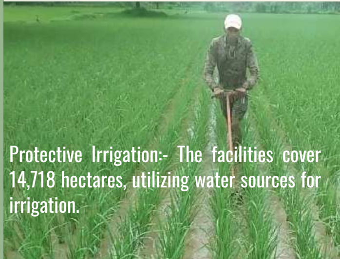
Protective Irrigation:- The facilities cover 14,718 hectares, utilizing water sources for irrigation.