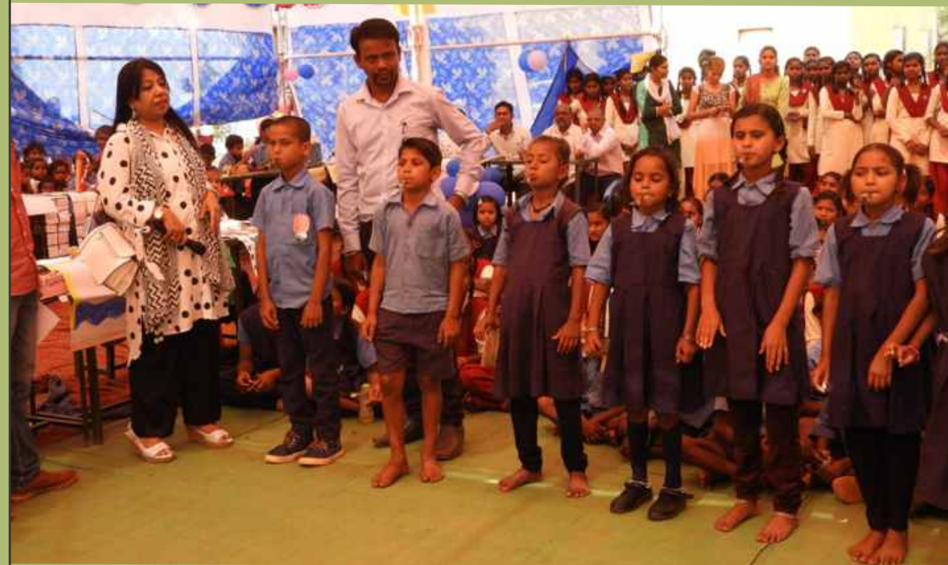
Joy of Learning through Baal Learning Melas