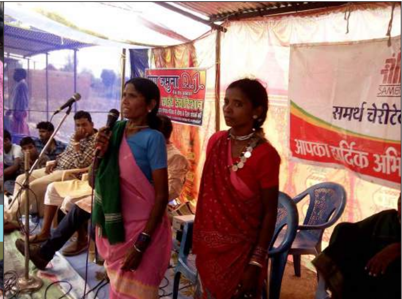
Sangathan women raise voice against alcohol abuse