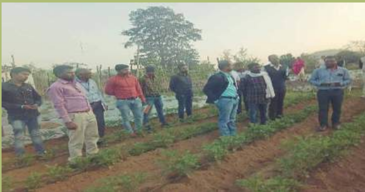
Surajpur District Collector visits the demonstration on organic farming facilitated by Samerth

The interventions cover 12 blocks of 7 districts (Bilaspur, Kawardha, Surajpur, Surguja, Mungeli, Mahasamund and Raipur) in Chhattisgarh.