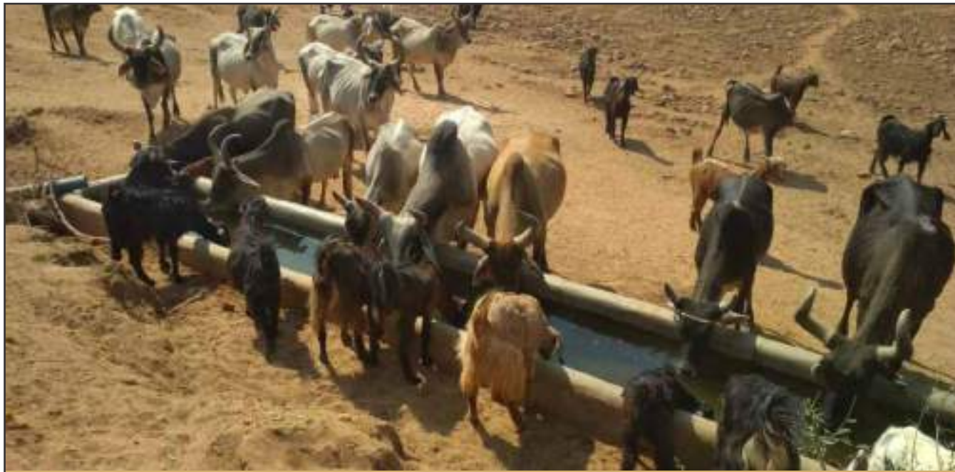
Cattle trough facilitated by Samerth in the interior of Dhabda village in Rapar, providing water to 2000 cattle in one of the worst droughts of the century