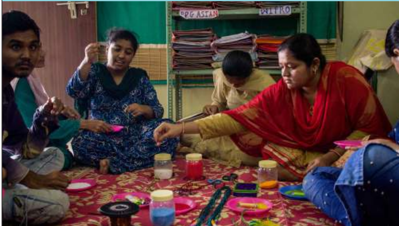
Vocational center - beadwork training to special needs trainees