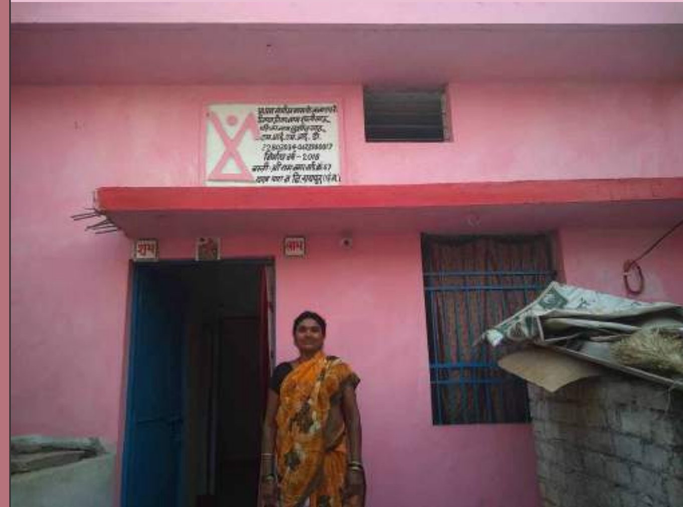
Facilitating Awas Yojana beneficiaries in construction of their houses