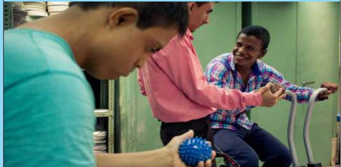
Children with special needs undergoing physio therapy at STK in Ahmedabad