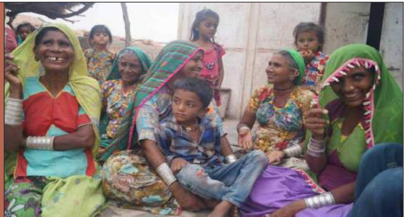
Focus group discussion with women from water committees in Rapar (kutch)