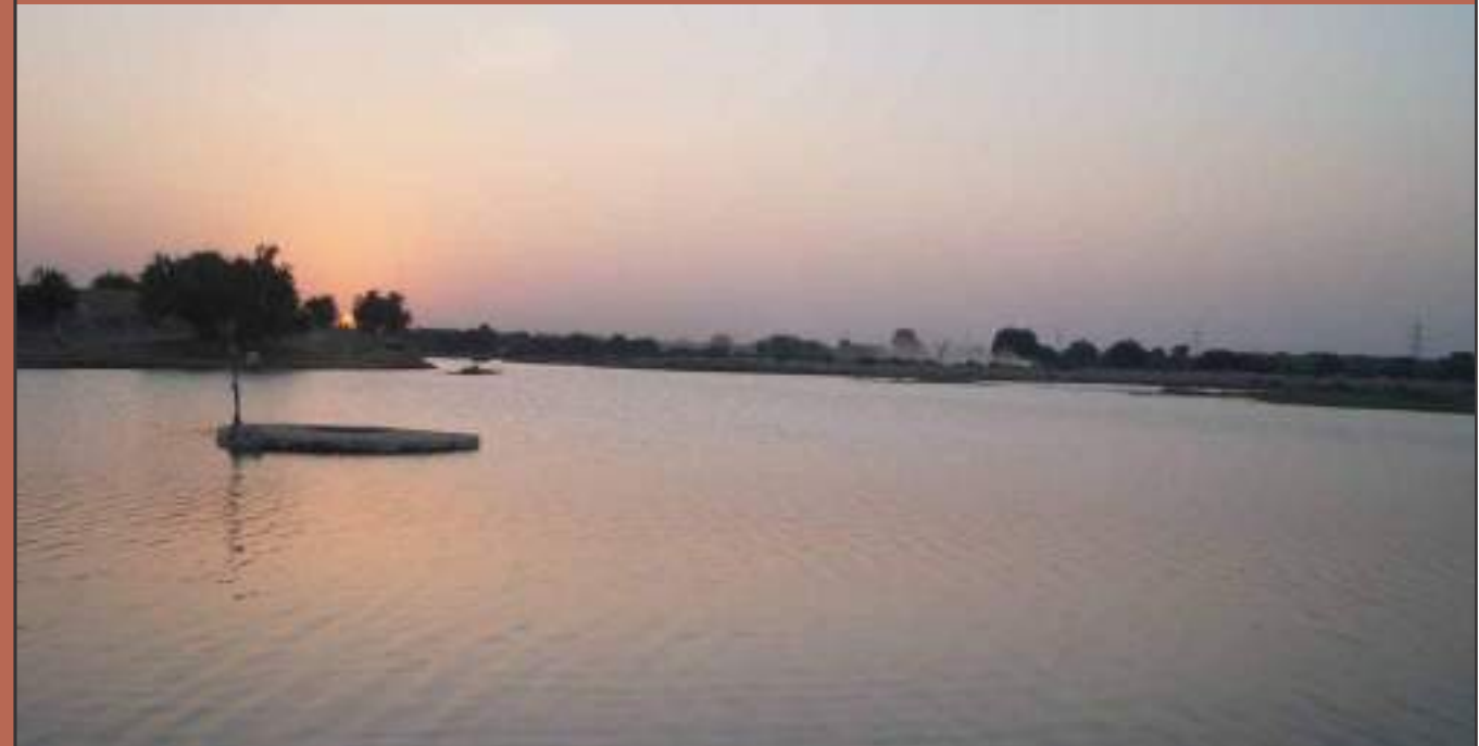
Village pond in Adesar providing water to 500 families, construction facilitated by Samerth