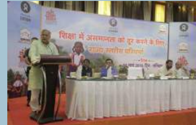
Honourable Chief Minister of Chhattisgarh Shri. Bhupesh Baghel addresses in the State level convention on "Reducing inequalities in Education"

We were fortunate to have the honorable Chief Minister of Chhattisgarh, Mr Bhupesh Baghel to participate in the discussion of reduction of inequality in education amongst the tribal children.