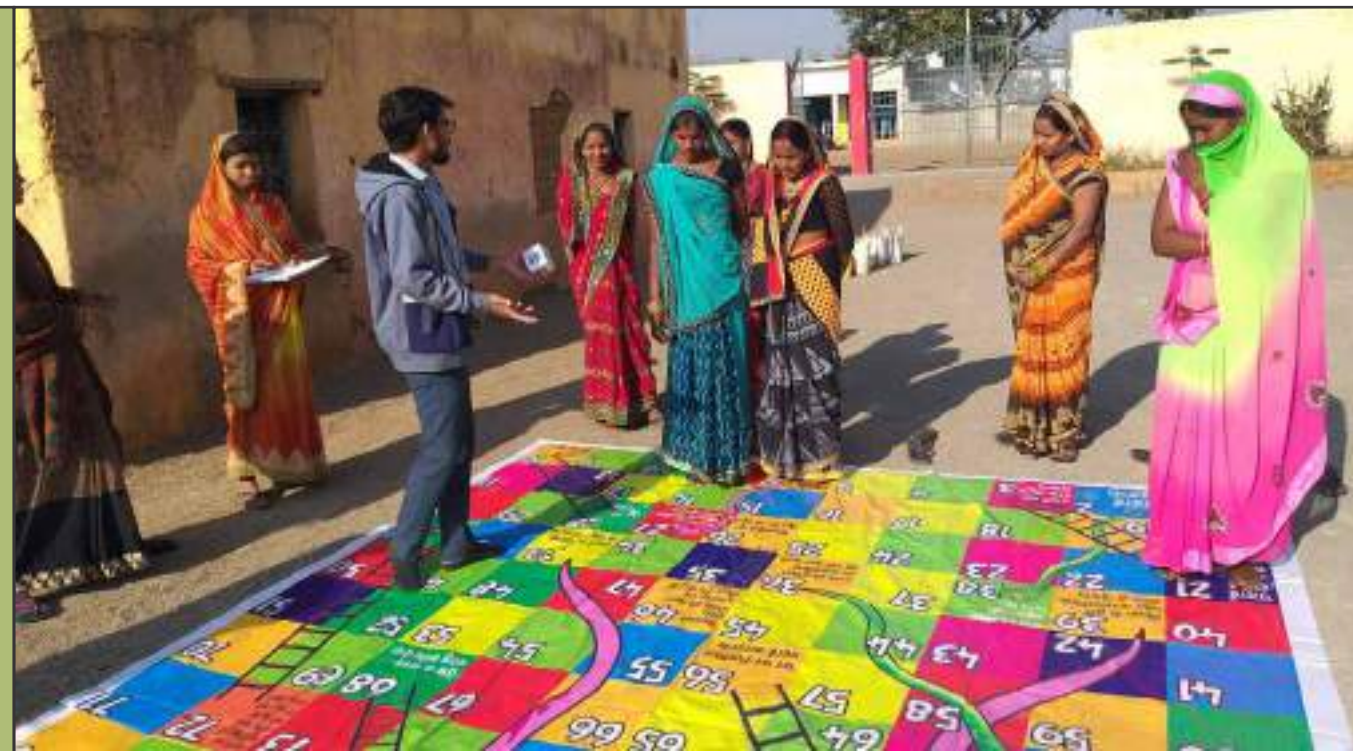
Capacity building of parents and community on Good Parenting