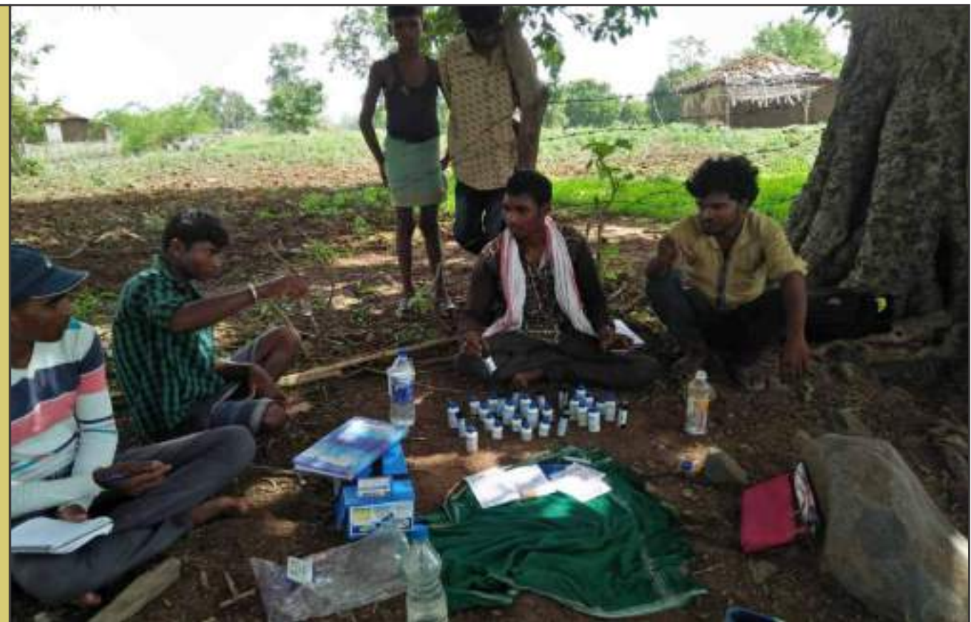
Training on water testing tools in Machapani village