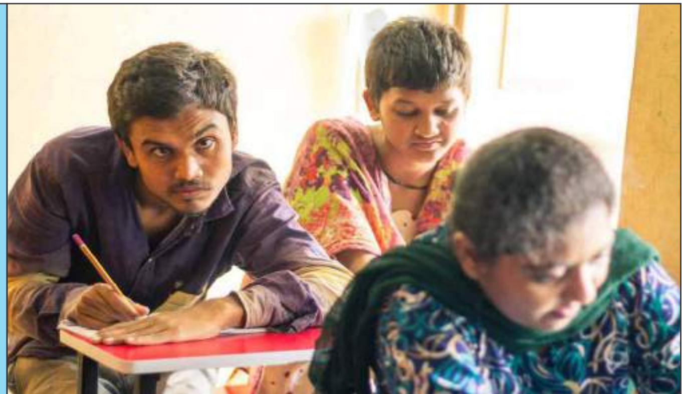
Young Adults with special needs learning to read and write at STK in Ahmedabad