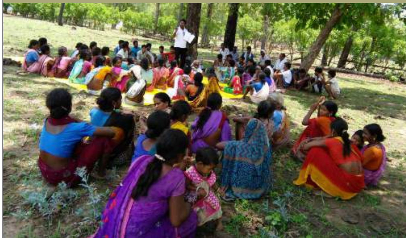
Strengthening self-governance by facilitating Mini Gramsabhas