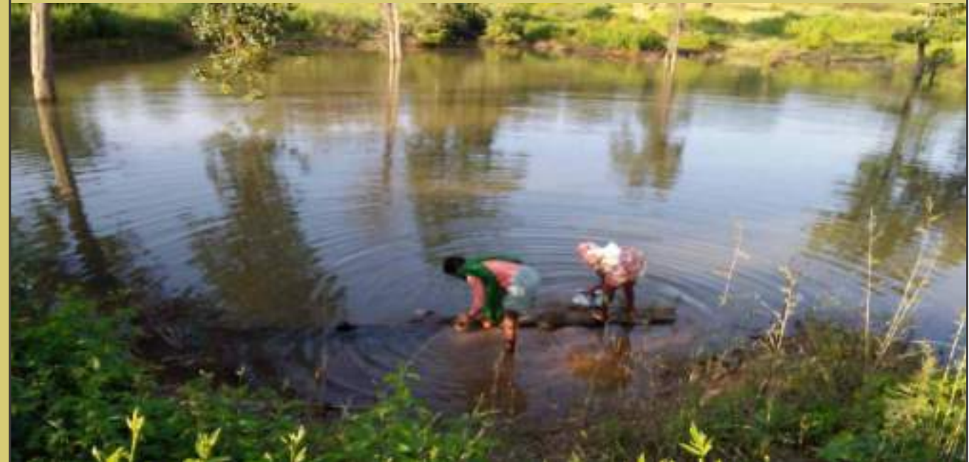
Tendvadih pond developed for domestic usage