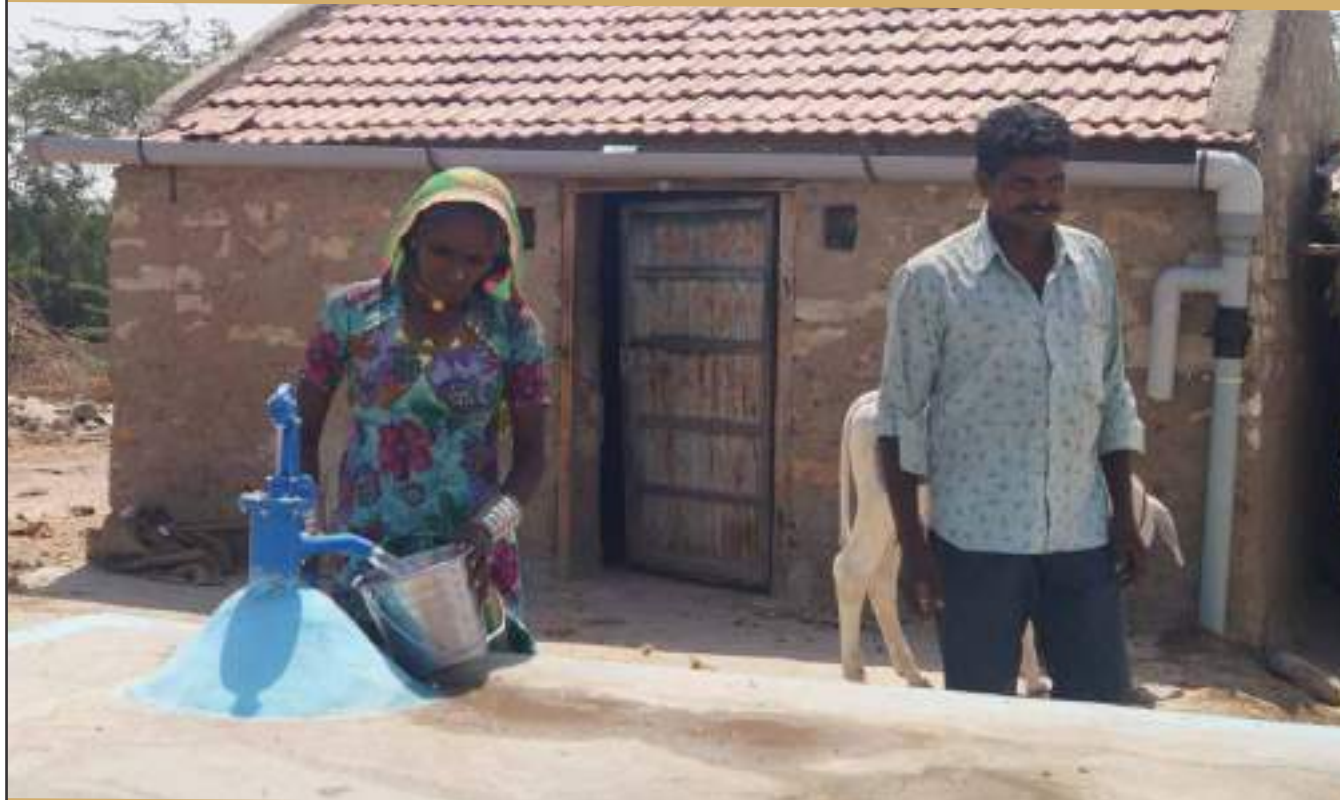
Rainroof water harvesting structure at Dungranivandh (Dholavira) 46 such structures were created in the year 2018-19