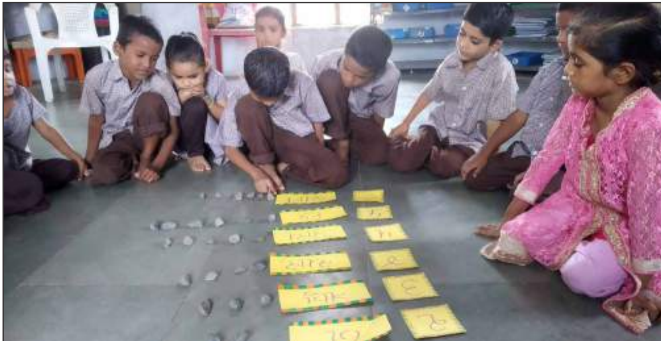
Children in government school learning by play way methods