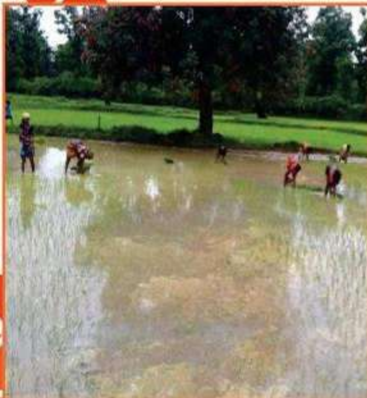
Farming Activities in Chhattisgarh