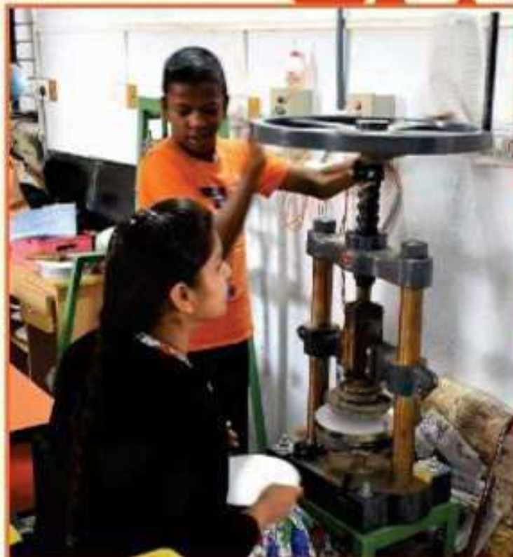
Vocational Programme with People with Disabilities