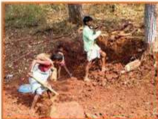
Communities working on NREGS site