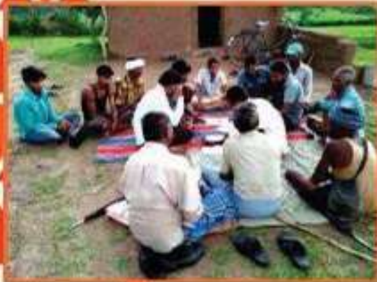
Meeting with community members for presenting village plan with the forest department