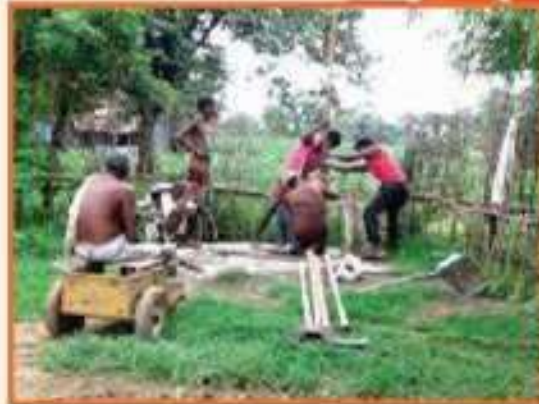
Hand pump repairing work at Sargadi village of Lormi block with the support of Jaldoots