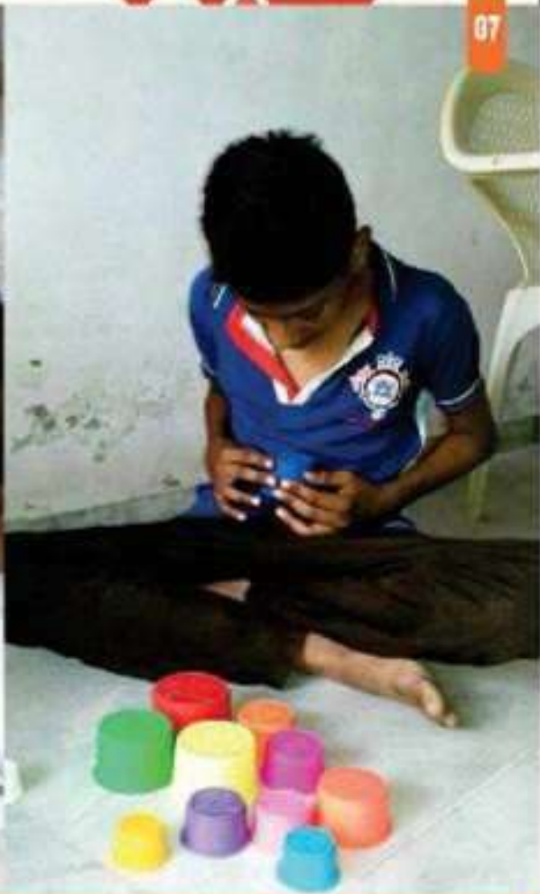
KUTCH, DEODAR, AHMEDABAD & CHHATTISGARH