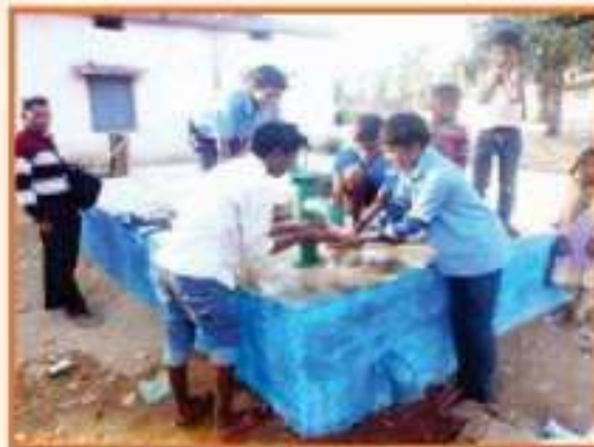
Children at Meka School in Bilaspur District drinking water from the structure